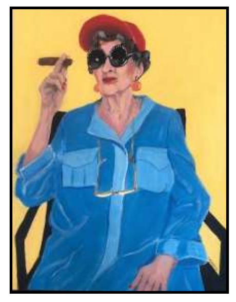
"Don't Mess With Florence"