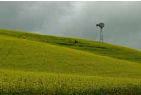
"Flaxen Solitude" by Cristal McQueen