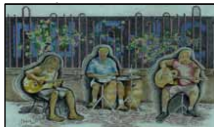
"Jammin' at Big Rock Park" by Joyce Norfolk

Looking for something to do locally that won't hurt your wallet? Pack a lunch, grab your camera and take in some local parks. Big Rock Park on Alabama hill (Bellingham) has beautiful gardens and most times has free live music.