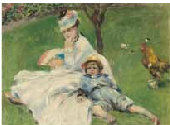
MADAME MONET AND HER SON, 1874, AUGUSTE RENOIR.