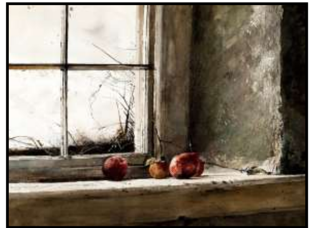
Andrew Wyeth Edward Hopper