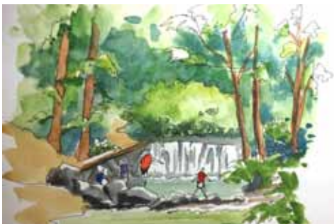
Whatcom Falls Park