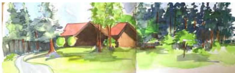
“Fairhaven Park” watercolor sketch by Karen