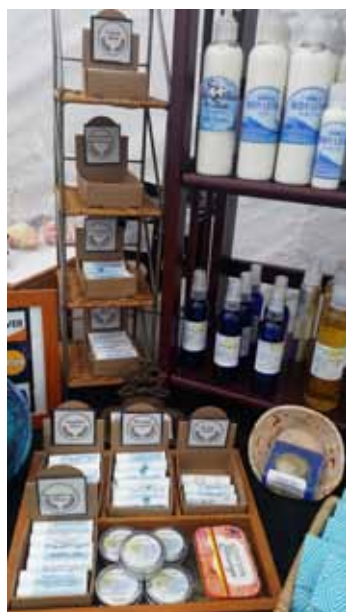
Products by Penny Welch