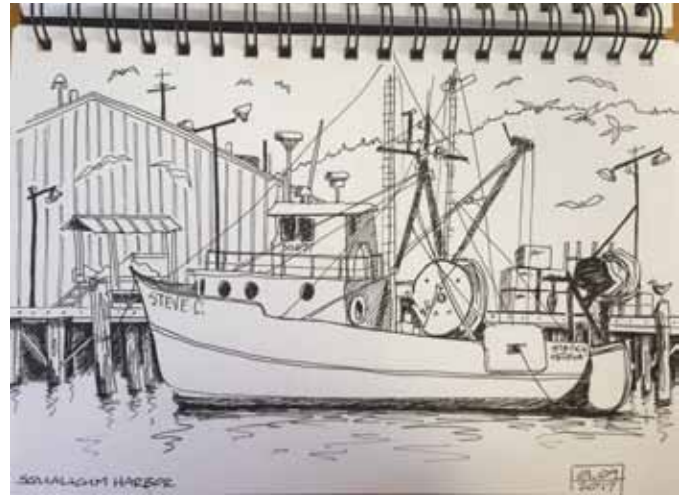
Sketch at Squalicum Harbor by Karen Ver Burg