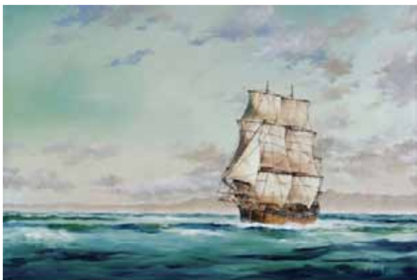
HMS ENDEAVOUR Oil On Canvas