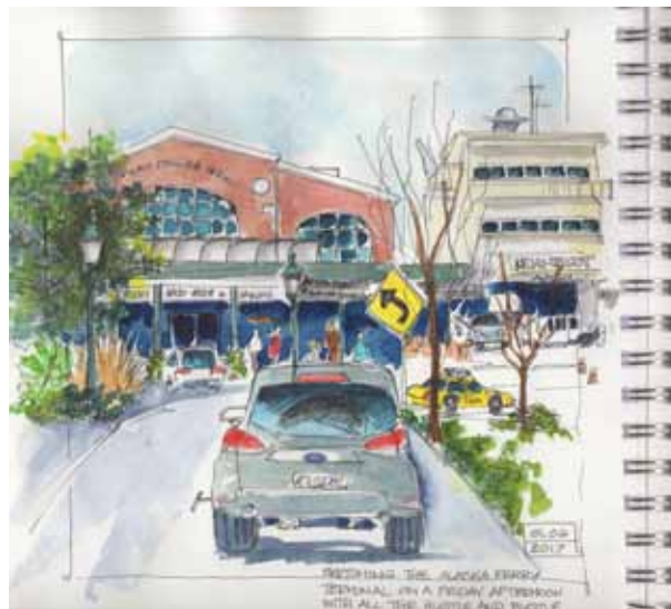
I sketched the Alaska Ferry Terminal from my car, trying to capture the hustle and bustle of activity as the ferry was loading.

I challenge all of you to think about learning to sketch your world, one drawing at a time.