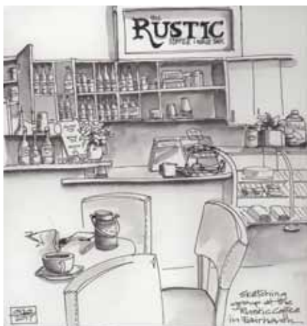
Karen's Sketch of Rustic Coffee in Fairhaven.