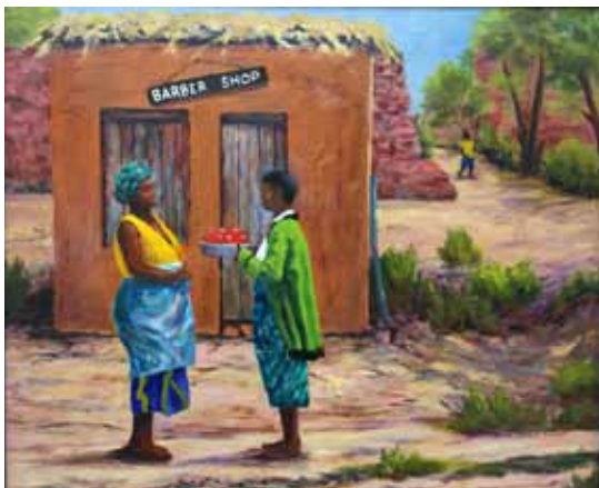
Oil painting by Caroline Schauer (see page 5)