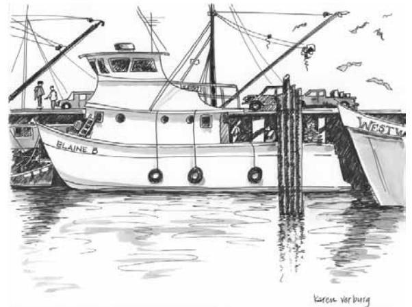
I sketched the commercial fishing boats and fishermen at Squalicum Harbor as they were preparing to head out to sea.

Have you ever thought about learning to sketch your world? Learning to draw and sketch is something that I am passionate about. I believe that learning to draw "what you see", and not what you "think you see" is vitally important for an artist, and those who do not learn to draw will have a disadvantage. The time and effort that I have spent learning to draw has been the most beneficial of my artistic endeavors. Anyone can learn to draw if they really want to.