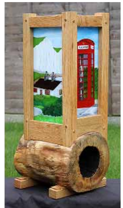
The White Cliffs of Dover on one side and a typical English telephone booth on the back side.

A particular challenge was the traditional British telephone booth and the details inside the booth. Knowing my painting skills could not do justice to the interior, I decided to cut the interior paper section out and glue it on to the front of the clear glass panel. Remembering Ray Bradbury's book Fahrenheit 451 and his claim that this is the temperature at which paper autoignites, I put faith in his claim and proceeded to paint the rear portions of the booth on the back of the clear glass panel. After baking this piece for 45 minutes at 126 degrees below Bradbury's claim, it was with great anticipation that I opened the oven door after several hours of gradual cooling. What a sense of relief when I saw the paper undamaged, a moment punctuated by my exclamation, "You were right, Ray!" Transfer type on paper for the front TELEPHONE sign and the tapered side TELEPHONE sign made with Photoshop were later baked in the oven with similar success.