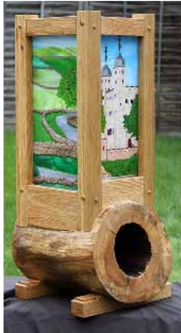
Tower of London on the front and English countryside to the left. Lamp framework made of English oak atop a birch log base.