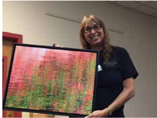
Cassandra won 2nd place for her photo of a reflection of trees on rippling water.