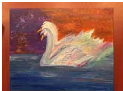
Painting by Genora Powell