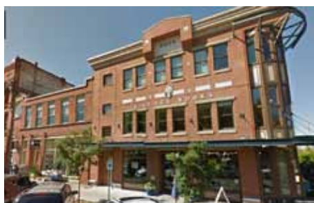
Colophon Café & Village Books