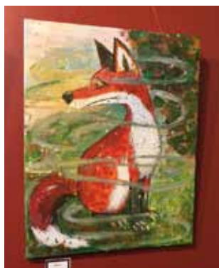
Painting by Genora Powell

Mila Faulkner and Genora Powell are showing their work at Village Books , downstairs in the "writers corner". Be sure to stop by when you're in the neighborhood.