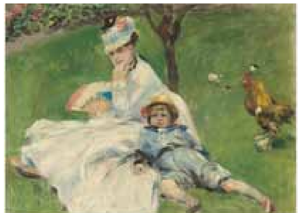
MADAME MONET AND HER SON, 1874, AUGUSTE RENOIR.