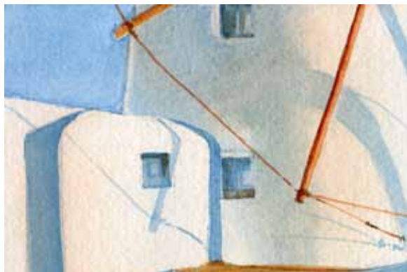
"Windmill in Mykonos"

Send completed form with check (payable to Whatcom Art Guild) to: WAG Membership, P.O. Box 3005, Bellingham, WA 98227