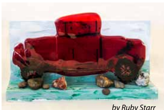
by Ruby Starr