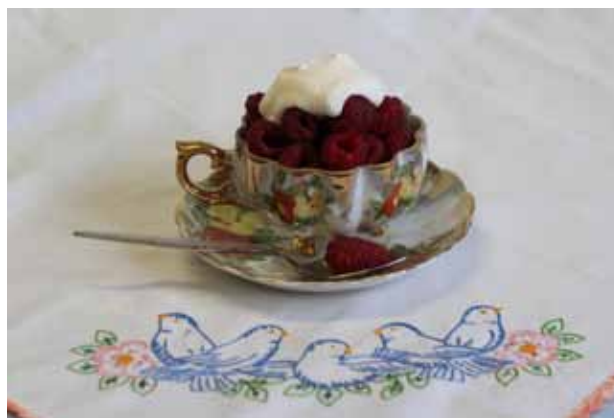
by Pam Pontius