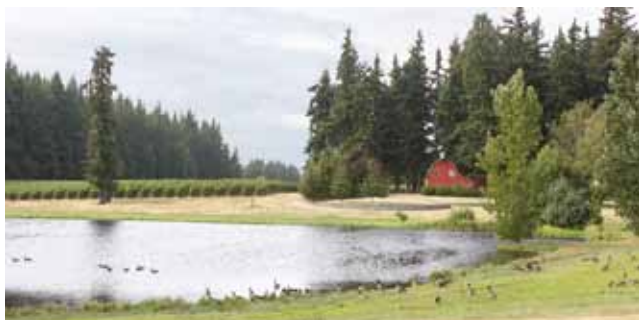
by Lorraine Day