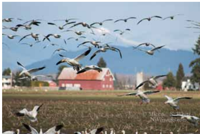
"Falling Snows" Photography by Michael White