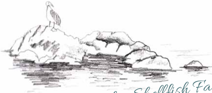
Taylor Shellfish Farm