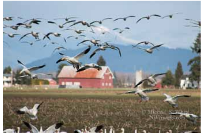
"Falling Snows"