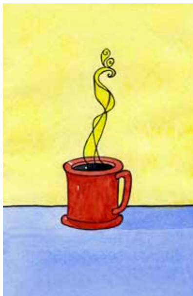
by Norma Appleton